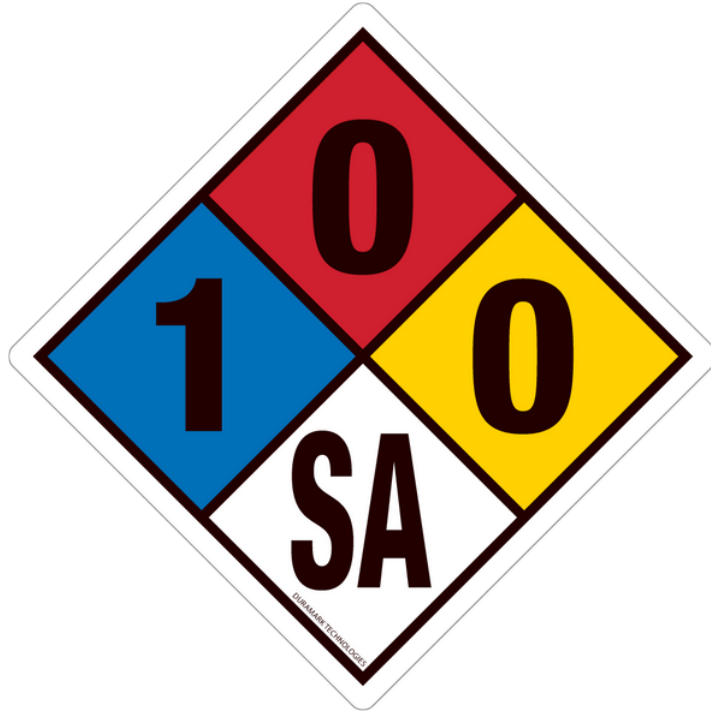
Example B: CO2 Caution Sign